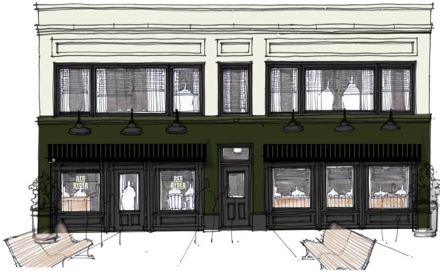
Above: Schematic rendering of the exterior

A sneak peek at the new wateringhole you never knew you needed