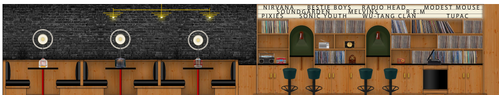
Upper and Lower Images: Interior renderings of the restaurant's bar and DJ area