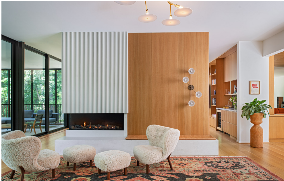
Upper image: The lounge with bespoke banquette and custom built-ins.