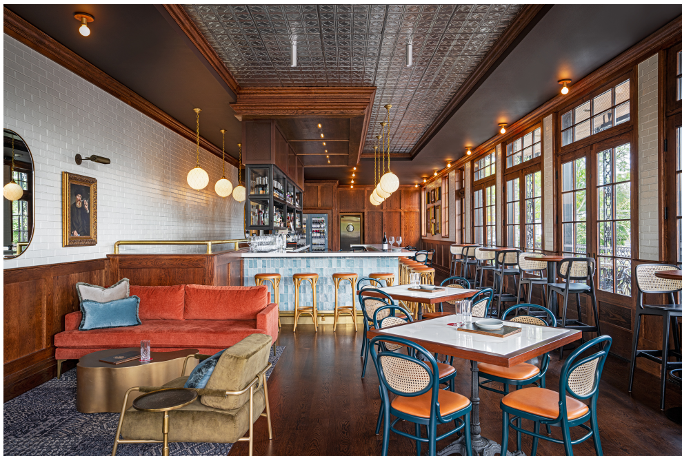
Upper Image: A view down the shotgun style bar.